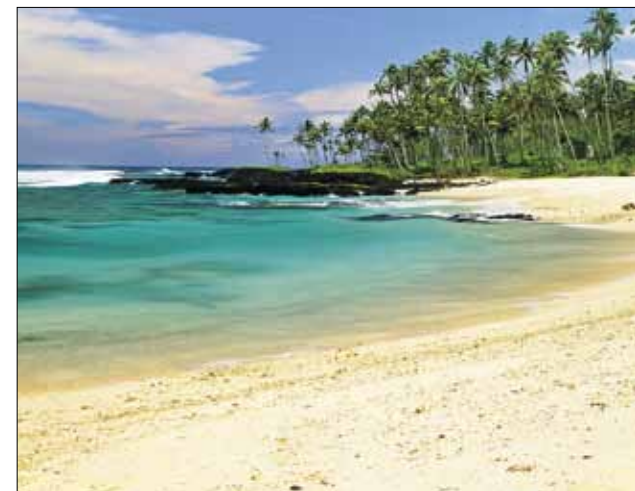
Return to Paradise Beach, Samoa

The beach itself is best shot in midday, but the sand is so white there, it really gave me problems with exposure when shooting film. HDR would be ideal to tame the dark aquamarines and blues of the sky with the extreme white of the beach—one of the whitest in the world. My composition included the length of the beach and the grove of palms at the far end. You can be the judge as to the success of the image, shown here.