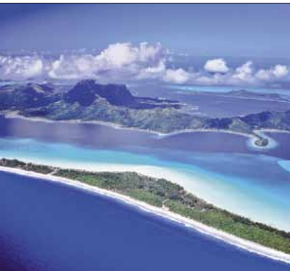
Aerial view of Bora Bora

Probably the most remarkable scenic photos of the island are captured from above in a helicopter, where you can achieve a sense of wonder for what the island is. As mentioned elsewhere in this book, you should fly with a group tour to save money, shoot through the bubble and use a polarizer to cut glare. Many helicopters have windows which open wide enough to use up to a 16mm lens. And remember, an outside seat is best. Not all helicopter pilots will go high enough to see the entire island. This is something you might ask about before you book your flight. Chartering a helicopter will solve this problem, but again, it's not cheap.