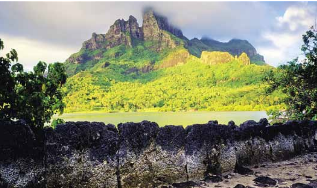
Ancient Polynesian 'Marae', Bora Bora

Probably the most remarkable scenic photos of the island are captured from above in a helicopter, where you can achieve a sense of wonder for what the island is. As mentioned elsewhere in this book, you should fly with a group tour to save money, shoot through the bubble and use a polarizer to cut glare. Many helicopters have windows which open wide enough to use up to a 16mm lens. And remember, an outside seat is best. Not all helicopter pilots will go high enough to see the entire island. This is something you might ask about before you book your flight. Chartering a helicopter will solve this problem, but again, it's not cheap.