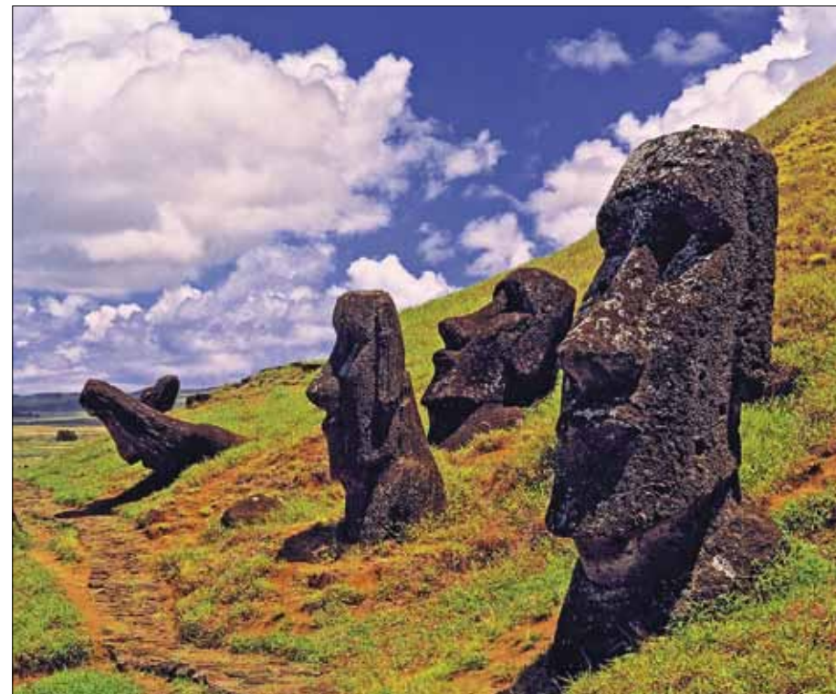
Moai statues at Rano Raraku, Easter Island

to see and shoot the Vaipo Waterfall—the highest in the South Pacific at 1,148 feet. The falls come down a line of cliffs that is very reminiscent of the beautiful volcanic ridges of Kaua'i. On Hiva Oa Island there are a number of carved deity figures with a slight resemblance to the famous Easter Island Moai statues.