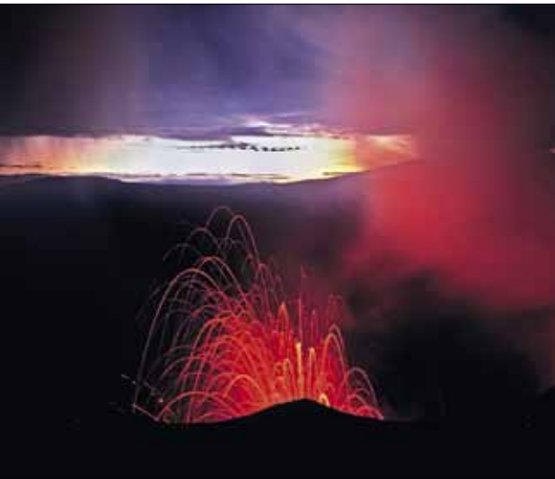
Yasur Volcano at Sunset, Tanna Island

The trip to the top of the volcano takes about two hours. As you approach, you'll see a large lava dam with some water pouring over it. During heavy rains, this can turn into a raging river, making the visit to the volcano difficult. Coincidentally, it also becomes one of the world's most photogenic waterfalls, with hundreds of ribbons of water pouring over the natural obstruction. Visiting in the dry season would reduce the chance of seeing and photographing this wonder. At the same time, the dry season reduces the likelihood of disease and the trip to the crater is easier. Perhaps the answer is to visit at both times of the year.