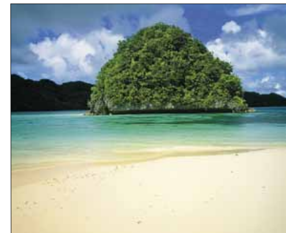
Honeymoon Beach Afternoon

In this case, I was fortunate enough to come back with several great shots by renting a boat and exploring the Rock Islands by land rather than air. I found strands of beautiful white sand only a few feet wide, with turquoise waters all around. I discovered great beaches like Honeymoon Beach that I shot by wading my 4x5 and tripod out into the ocean, 20 feet or more from