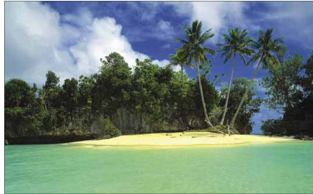
Honeymoon Beach, Rock Islands Nat'l Park, Palau

To stand on the rim of Yasur Volcano, though, is a chance to experience and photograph one of Mother Nature's most violent and beautiful events.