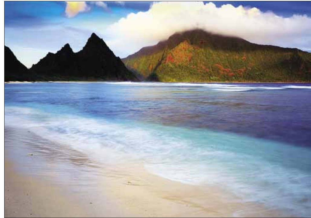
Sunset light at Ofu Beach

the miles of beach to the spiky mountains in the distance, and although I prefer sunrise, sunset also works well. For shooting the beautiful turquoise water, mid-day light is best.