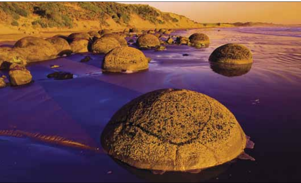
Moreaki Boulders at sunrise