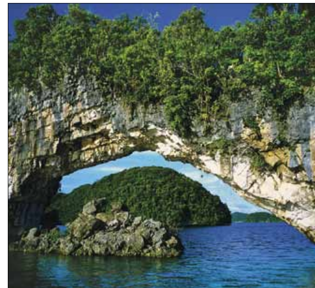
Rock Islands Arch, Palau

Guides are necessary to adequately explore the Rock Islands.