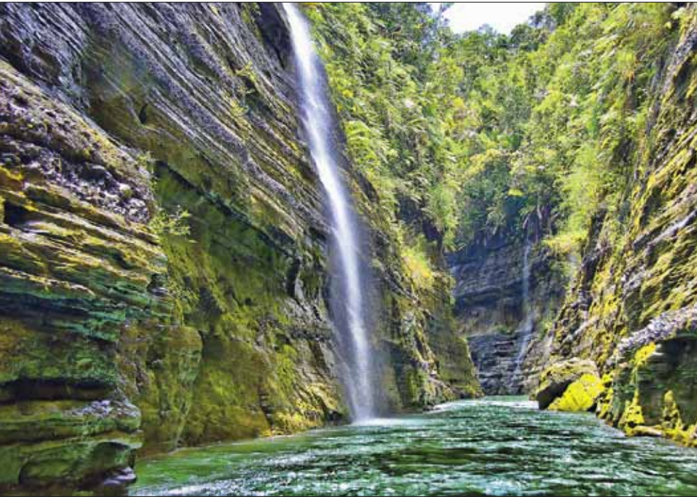
Along the Upper Navua River, Fiji

Lupine in various extraordinary colors line the road in early summer here, making great foreground for ocean views along the way to Nugget Point.