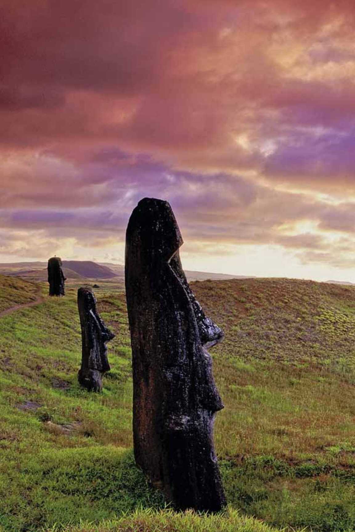
Left: Moai statues, Ahu A Kivi, Easter Island

Vehicles are for rent on the island, and even though the place is small, the many statues are too far to walk to in the hot tropical sun. One exception is the Moai on the western coast (facing east) right near the town. Other great statue sites include the row of seven at Ahu Akivi, just north of town. These make a great panoramic image.