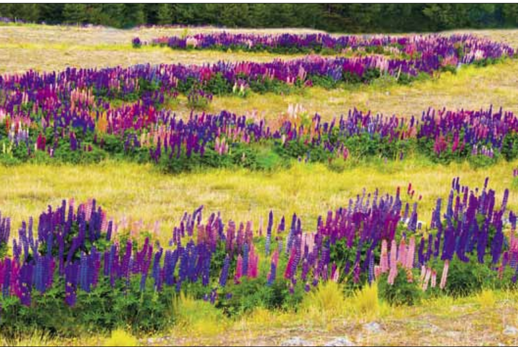
Lupine curving along a creek near Mt. Cook

Other photogenic fiords worldwide include the world's only desert fiords on the Musandam Peninsula in Oman. Imagine the ocean with coral reefs, surrounded by desert walls thousands of feet high. It's so reminiscent of Lake Powell in Utah and Arizona that you have to keep reminding yourself you're on the ocean, not an inland lake. Though the Musandam fiords are best seen by boat, there is road access to beautiful viewpoints.