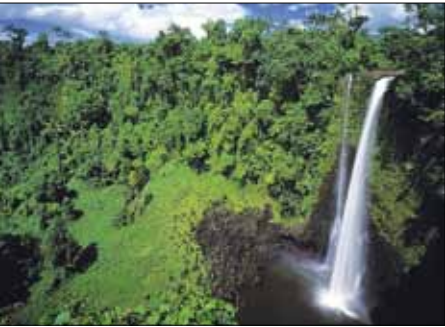
Fuipisia Falls & Rainforest

The island of Upolu has at least six major waterfalls, all ensconced in some of the greenest jungles I have ever experienced. Fuipisia and Sopo'aga Falls are very close to together and in good proximity to the road. Tiavi Falls is a long thin thread. Because of the thick jungle, photographers are forced to shoot from a few cleared areas where the falls can be seen unencumbered. The water flow in the falls is best during the wet season, lasting November to March.