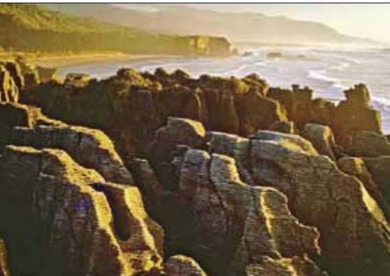
Sculpted Limestone, Paparoa Nat'l Park

On opposite sides of New Zealand's South Island, two distinctive geologic formations provide substantial and unique landscape photography opportunities. The Pancake Rocks of Paparoa National Park are the coastal expression of a vast interior of spectacular and rarely photographed limestone canyons and rock formations. Guided trips inside these little-known but stupendous locations are widely available. The Pancake Rocks themselves are a drive-in location at the national park: beautiful wedges of ocean-sculpted limestone that look only slightly like the breakfast food. This West Coast location is best at sunset, with overlooks that afford magnificent vistas down the coast.