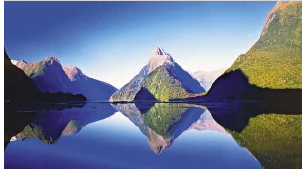
Mitre Peak morning reflection

yourself at the small town of Moreaki on the East Coast of the South Island, where a short drive will take you to a magical area of natural globes, or concretions to be more precise, that have eroded from the headlands and now litter the beach like ponderous beach balls. A low tide with sunlight at dawn is best. Don't expect your subjects to be the same each time you visit. Many huge round boulders I shot in the late 1980's were sunk fairly deep in sand in 2007.