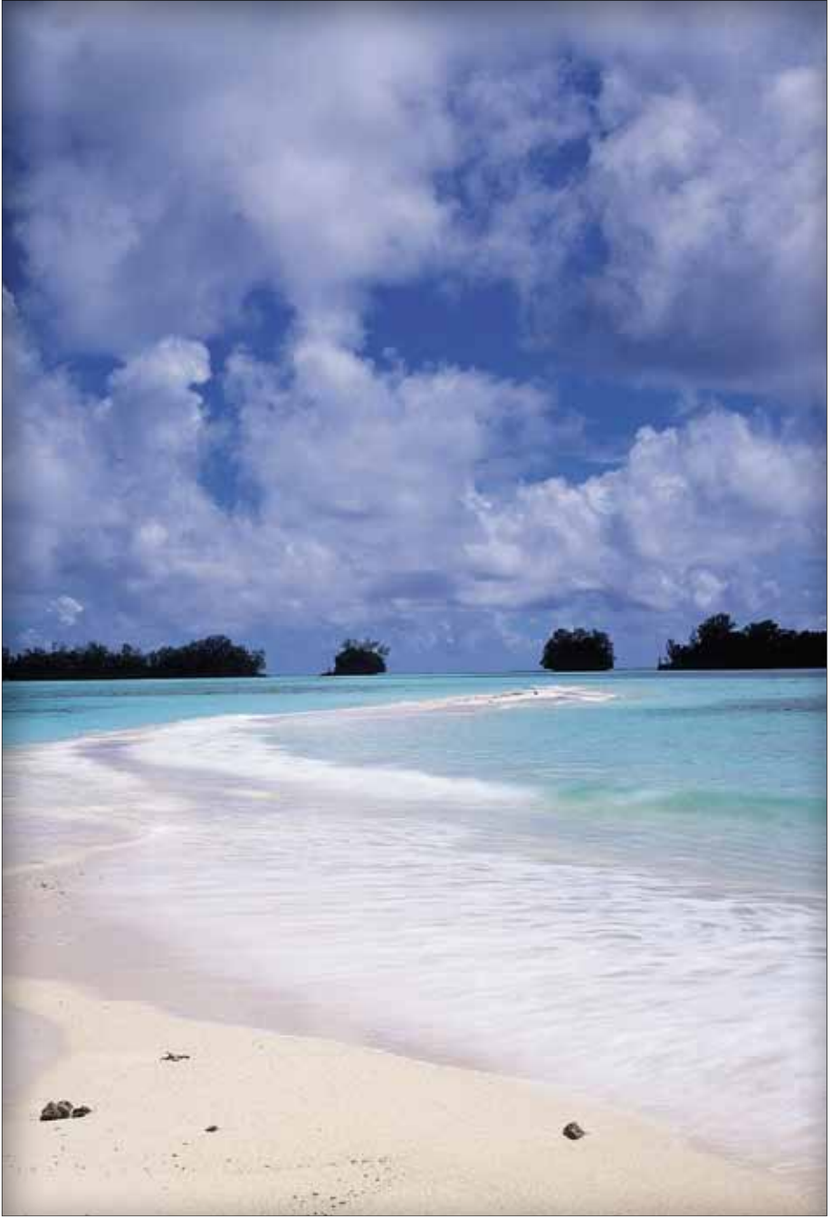
Tiny Strand of Sand, Rock Islands Nat'l Park, Palau