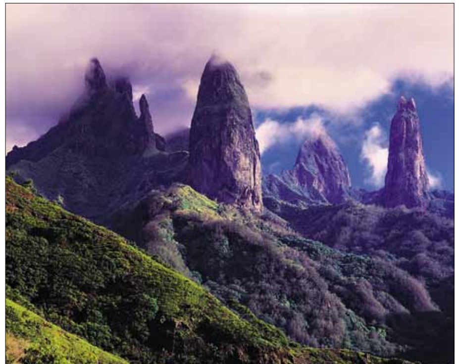
Cathedral spires of Oave Mountain, Ua Pou Island, French Polynesia

Nearby locations: Other islands in the Marquesas harbor some wonderful photographic subjects. On the main island of Nuku Hiva, helicopter flights allow you