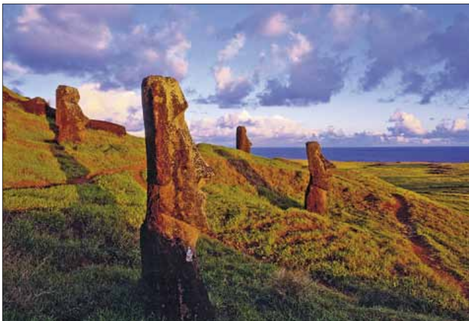
Moai Statues at Rano Raraku

By far the most amazing setting for the Moai is Ahu Tongariki. It is a great sunrise location with more than a dozen statues backed by high volcanic cliffs and the ocean. A number of shots are possible here, including a wide angle panoramic of the entire grouping to telephoto scenes of the statues with the setting sun. This amazing scene is a recent addition to the park, being restored in the 1990's. You may need a four wheel drive vehicle to get there if roads are bad or washed out.