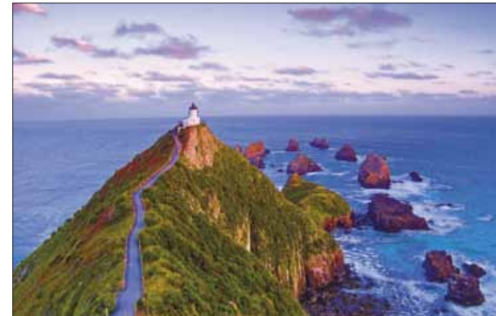
Lighthouse at Nugget Point

Perched on the southern end of South Island, with nothing but thousands of miles of ocean until Antarctica, Nugget Point Lighthouse has geographical significance. It is also a scenic treasure. With the leading lines of the trail guiding your eye up to the tiny structure, and the Nuggets sea stacks to the right, I can't think of a more beautiful lighthouse setting in the world.