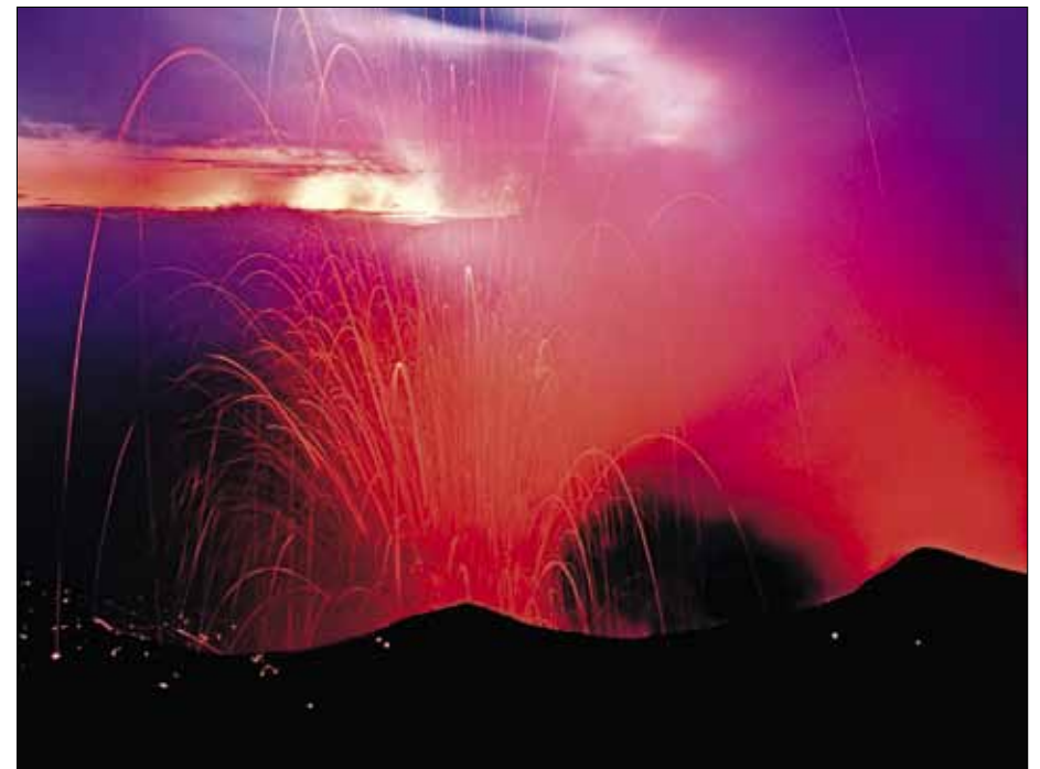
Eruptions of Yasur Volcano at Sunset, Tanna Island, Vanuatu

Yasur is described as the world's only drive-in volcano. Getting there is a bit of a long process, but it's well worth it. I suggest you fly to Australia first, and then take the Qantas flight to Port Vila, on the island of Efate. There are a number