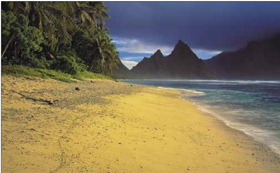
Morning light at Ofu Beach

On the island of Ofu, a short distance from the pleasant lodge there, it's a good chance you'll have Ofu Beach to yourself. The idea here is to shoot down